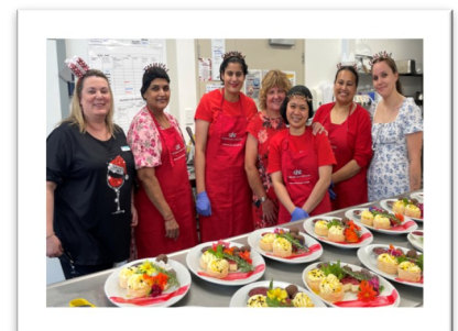
Well done to our kitchen team for delivering a memorable Christmas lunch enjoyed by all.

Our volunteers were also thanked with a special afternoon tea in recognition of their ongoing support. The final bus outing for 2025 was a trip to the Operatunity Show's Christmas Spectacular, and the popular bus trip picnics resumed again in February.