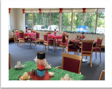
New dining chairs add a stylish upgrade to the dining experience.

Extra sensor security lighting has been installed around the building and in the rear car park to improve safety and visibility, particularly overnight.