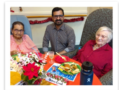
Residents and a family member sharing Christmas lunch together.

Many residents also enjoyed spending time with the bunnies, adding an extra sense of happiness and connection with nature.