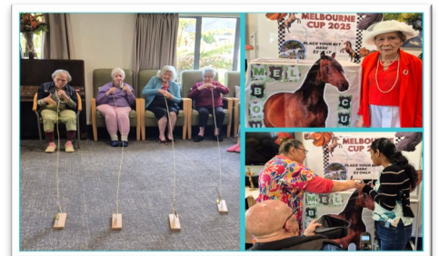
Melbourne Cup activity.