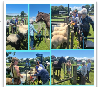
Ambury Farm outing.

Our weekly bus trips continue to bring heartwarming experiences for residents. A recent outing to Ambury Farm was especially meaningful for one resident who had volunteered there for 30 years. The sunny day was filled with laughter and joy as everyone interacted with the friendly animals, feeding chickens, sheep, and horses.