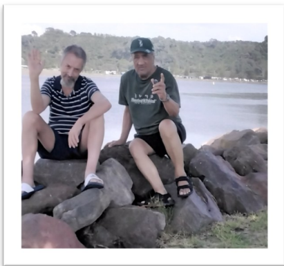
Residents enjoying a trip to the beach.

Over the summer months, our home was filled with a wide range of activities.