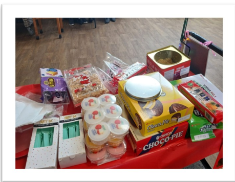
Chinese New Year snacks were a tasty treat.

Valentine's Day brought a lighter moment, with Cupid making a special appearance to share chocolates and pose for photos with residents.