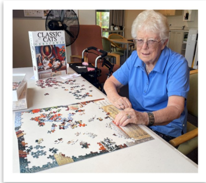
A new puzzle corner.

Our activities team has recently introduced a puzzle corner in the Kotuku lounge for residents to enjoy.