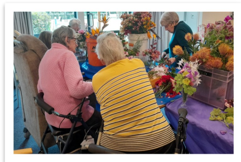
Residents enjoying flower arranging.

Our activities team works hard to ensure the programme and bus trips offer a variety of fresh and engaging experiences for residents. One recent highlight was our Waitangi Day celebration, which included a lovely flower-arranging activity. Residents created beautiful arrangements that were displayed throughout the care home for everyone to enjoy.