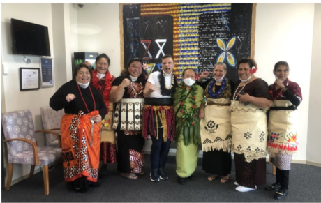
Tongan Church Group

Our Tongan Church Service, Vivili Kihe Eiki, has become a treasured part of our family, blessing our Pasifika residents every Thursday. With heartfelt prayers in their mother language and cultural performances, they have touched the hearts of our residents through their personal visits and prayers.