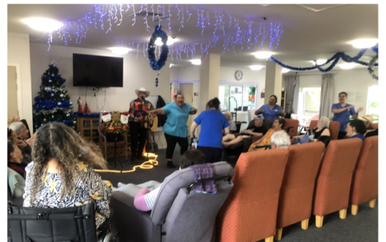
Christmas Day Fun!

Keeping our residents active and engaged is always a priority. We have introduced new aim games, featuring exciting challenges like Hookey, a dartboard-inspired game and Tic Tac Toe. Residents have enjoyed the friendly competition and thrill of trying something new each month.