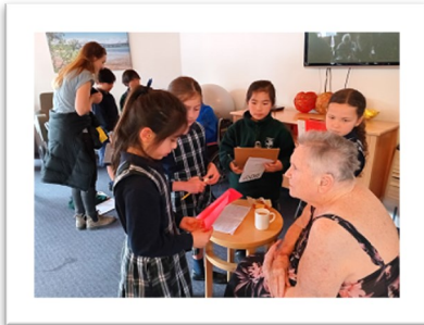
Children visit from St Mary's School

recalled their senior role becoming protective, adjusting their voices for the children, offering instruction and advice, acting like mentors or parents. Many of them live far from their families and do not get many opportunities to see their grandchildren growing up. These visits help our residents reminisce. Moreover, it is a great opportunity to make connection and help the residents feel part of their local community.