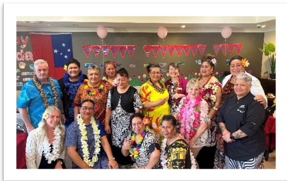
Samoan Language week

We appreciated the season with a Mid-Winter Celebration and raffle. We remembered those suffering from cancer on Daffodil Day with a sausage sizzle fundraiser and honoured our household staff on International Cleaners Day.