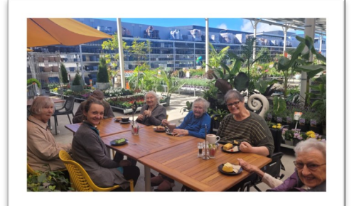
Weekly Van Trips

Our residents have started a new tradition where they all vote for places that they would like to visit in the weekly Van Trips. This time they all had a great time checking out the Café at the New Mitre 10 in Silverdale.