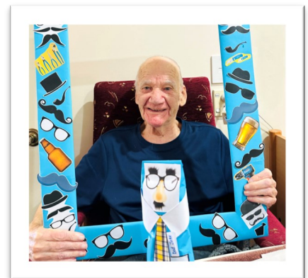
Murray with his Father's Day gift

The men were treated to happy hour with drinks, food and good conversation.