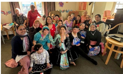
Staff in Cultural dress