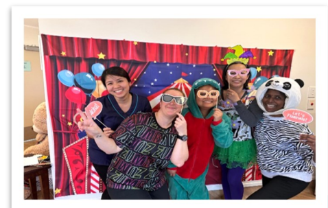
Staff enjoyed dressing up for Carnival Day

Kingsway Preschool visited us again. They sang and danced and they brought some bunches of lavender and cards with lots of love for our residents.