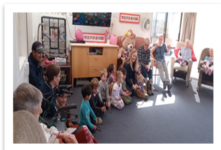
Kingsway Preschool Visit

Kingsway Preschool visited us again. They sang and danced and they brought some bunches of lavender and cards with lots of love for our residents.