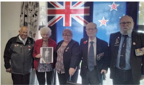
RSA Representatives at our ANZAC Service

For ANZAC Day, we had representatives from the local R.S.A. join us which made it even more special. It's truly heart-warming to see our residents honouring and remembering the sacrifices made by those who served in the wars.