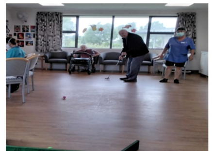
Indoor Mini Golf

The indoor activity not only provided entertainment but also had therapeutic benefits. It encourage physical activity, hand eye coordination and mental stimulation. The residents were actively engaged and it created camaraderie among them.